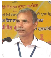
By: Er. Prabhat Kishore

"My poetry is a declaration of war, not an exordium to defeat. It is not the defeated soldier's drumbeat of despair, but the fighting warrior's will to win. It is not the dispirited voice of dejection but the stirring shout of victory"